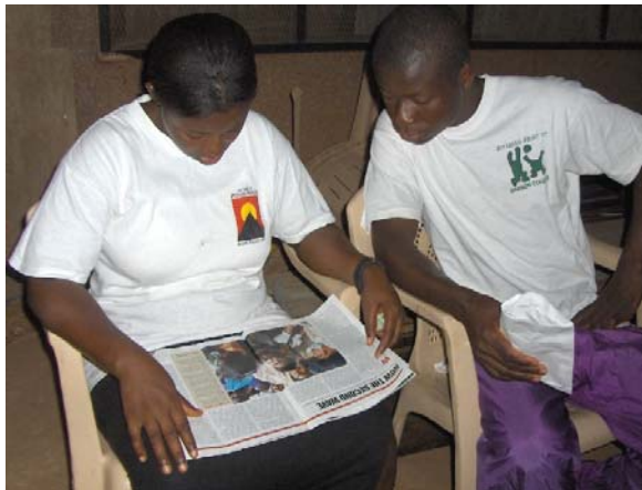
Tsunami offering collected at monthly Gathering

Yet we at Christ's Co-Mission have chosen to invest ourselves in West Africa because, though life is hard, sincere Christians are remaining faithful to God and are attempting to extend His kingdom. The local district of Manya Krobo has the highest rate of AIDS in Ghana, and its moral climate continues to decay as worldly influences from across the ocean send tidal waves of provocative pollution into the lives and minds of vulnerable young people. CCMI and our Ghanaian affiliate stand alongside local churches and Christians, shining forth light and hope in practical ways through the elementary school we run, the evangelism outreaches we conduct, and the job opportunities we provide. As we apply discipleship principles to everyday life it is making a difference in these lives and causes us to grow as well.